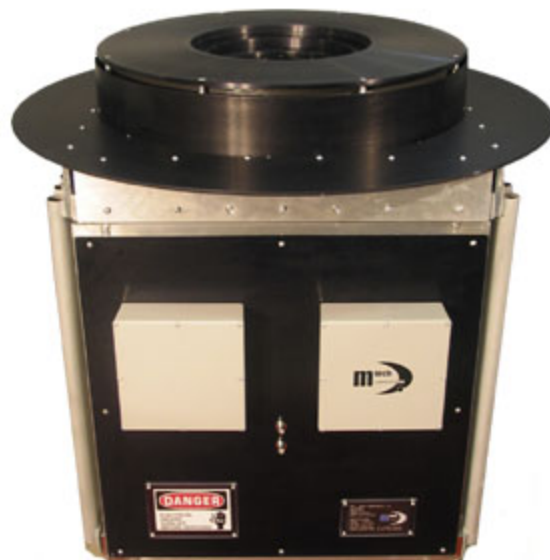
B1 SERIES MODEL B1-A

The B1 magnet system is a state-of-the-art, precision-wound, air-core electromagnet with ultra high stability and homogeneity. This magnet is intended for NMR/MRI applications. The magnet is unusually compact with a very low diameter-to-height ratio. The homogeneous zone can be adjusted over a large range by adjusting shim currents. The open access enables a variety of applications including medical research, food inspection, and industrial applications. A variety of shim coils and gradient coils is available, depending on the application needs. The magnet is easy to site, requires no maintenance, refrigeration, or added utilities. The magnet power dissipates less than 600 watts, and is compatible with most academic labs or industrial sites. It occupies a relatively small footprint and, unlike permanent magnets, the B1 magnet can be shut down at any time for safety reasons. It is also relatively inexpensive and lightweight compared to iron core or permanent magnets. The key feature of this magnet is its low profile, which is unattainable by competing technologies.